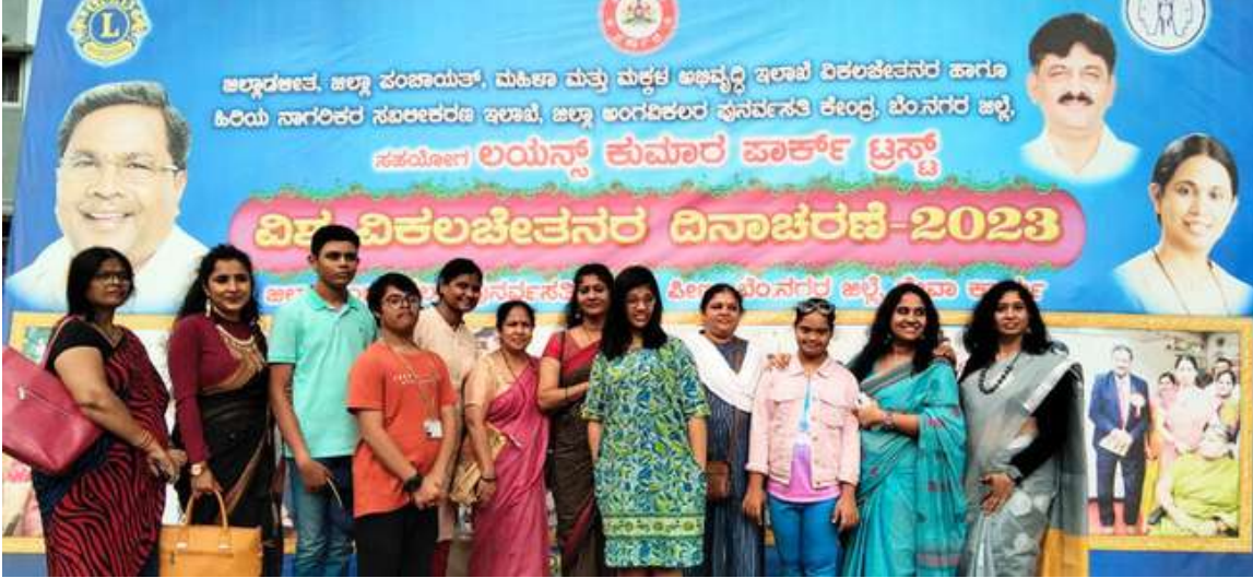
Chiranthana at Kanteerava Stadium for World Disabilities Day on 3rd Dec