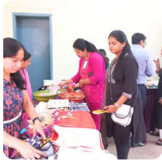
Pedenvicon at IISC