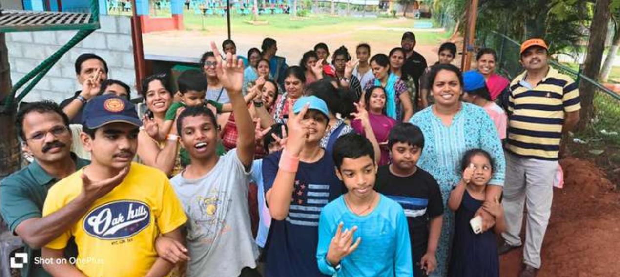
Field trip to Ruppi's resort