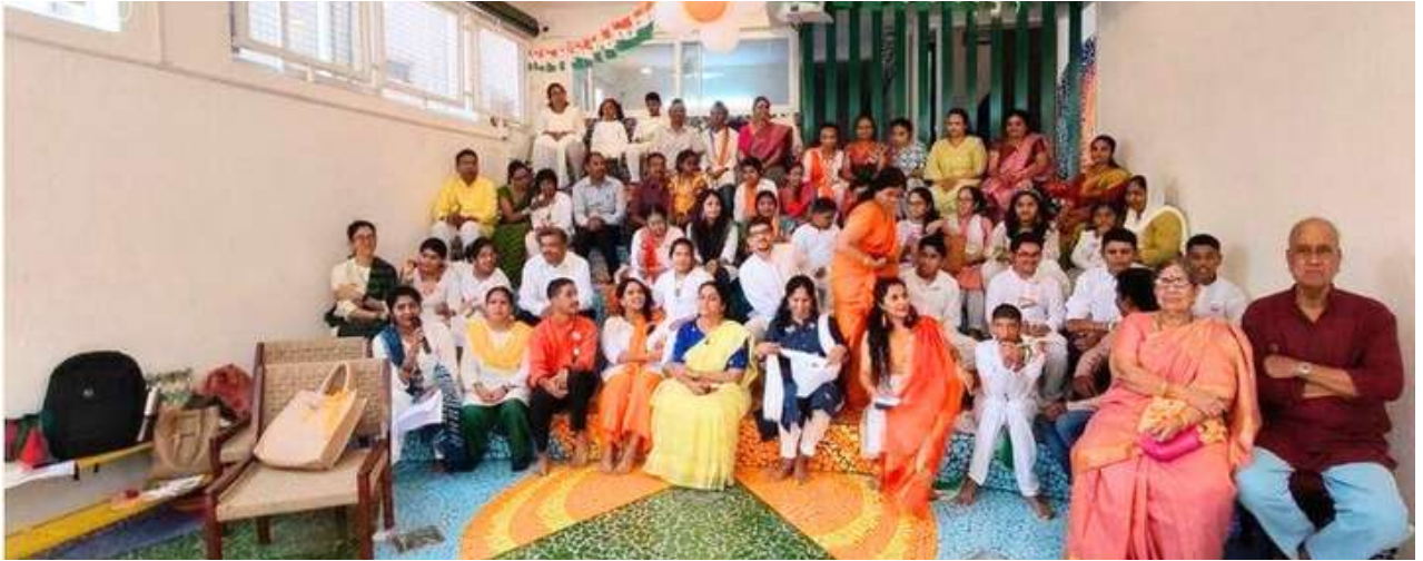
Independence day celebrations