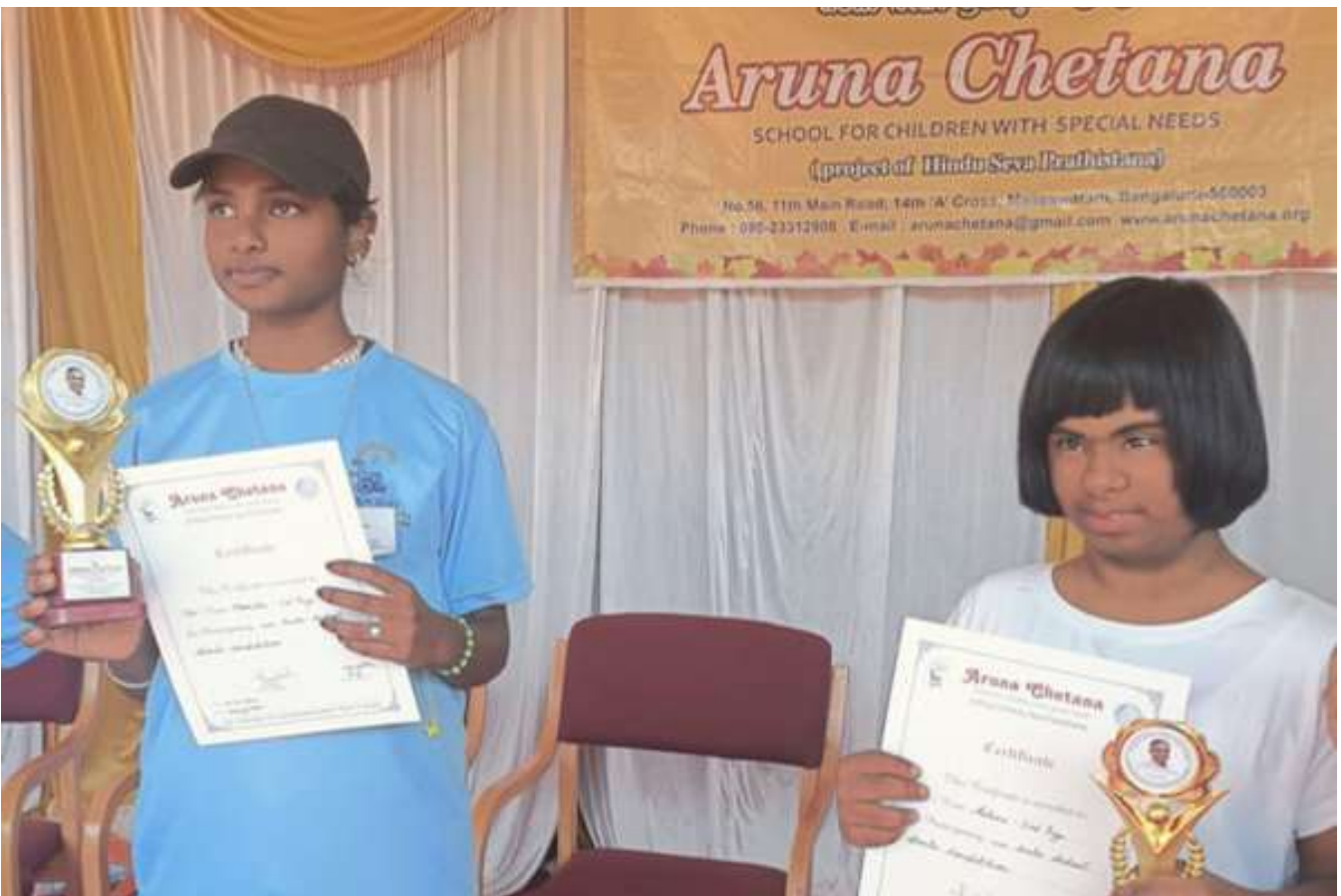
Divya Kreedha Shakthi