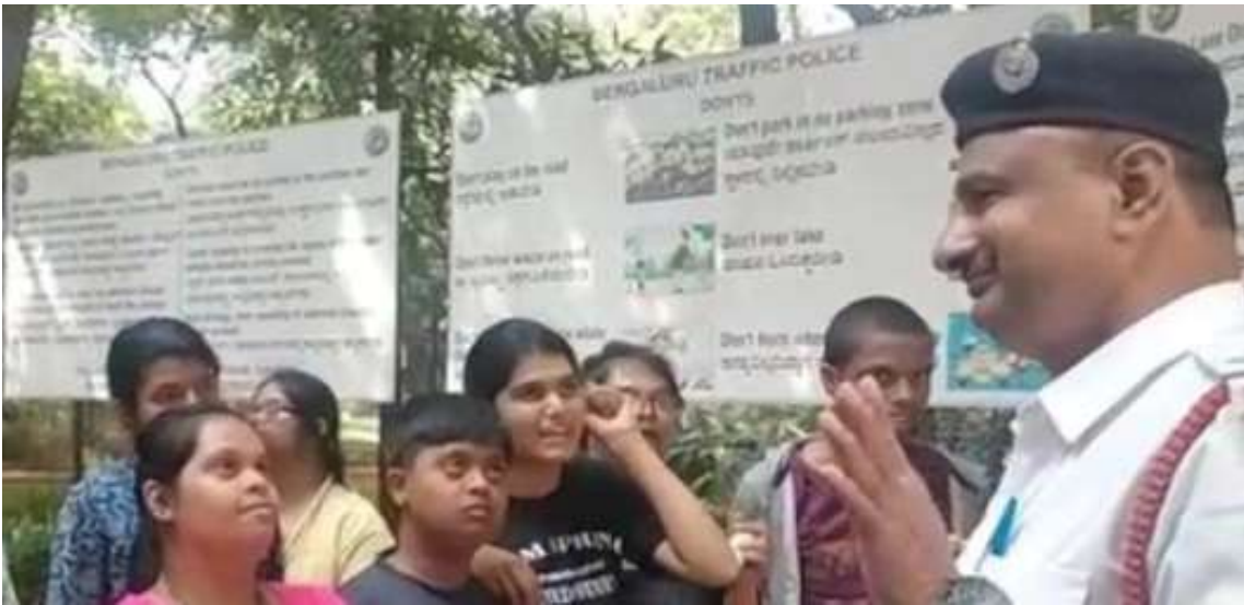
Field trip to Police station