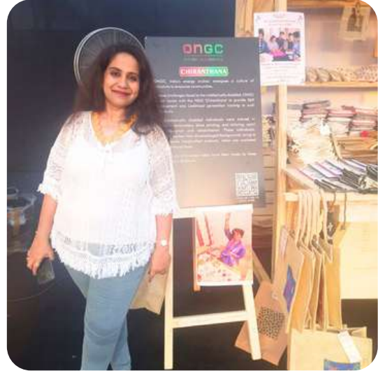
India Energy Week Exhibition organised by ONGC at Goa