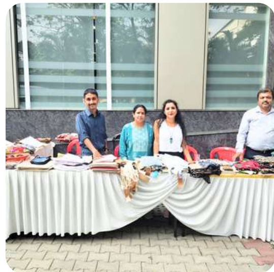
Brigade Software Park