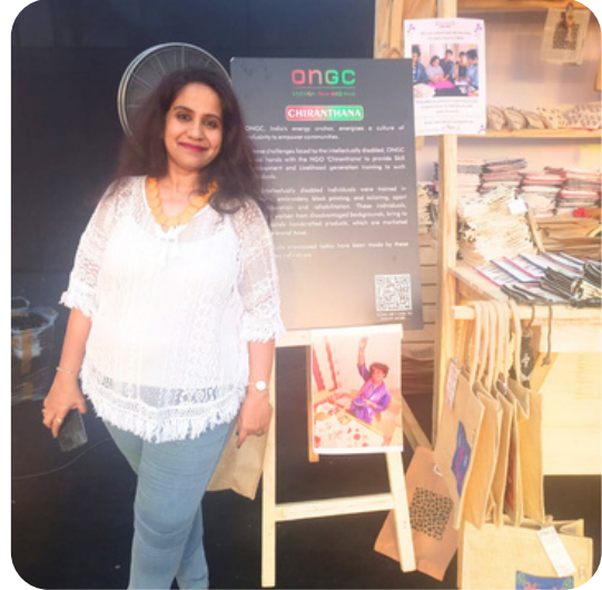
India Energy Week Exhibition organised by ONGC at Goa