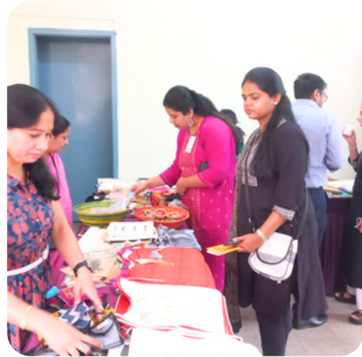
Pedenvicon at IISC