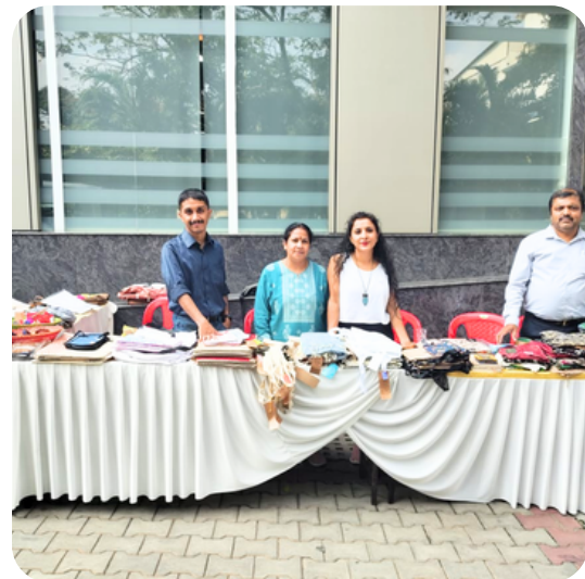
Brigade Software Park