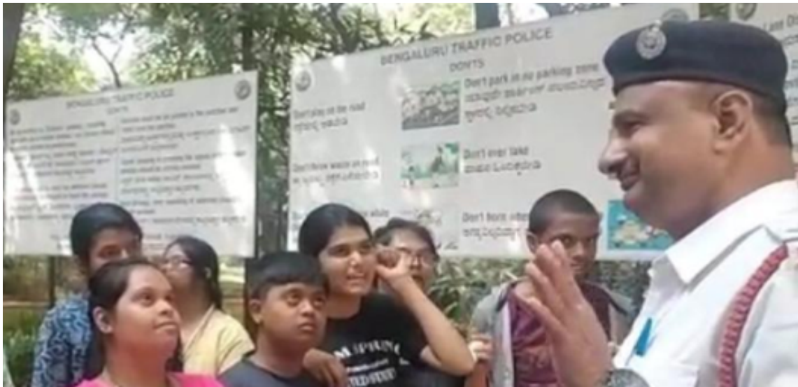
Field trip to Police station