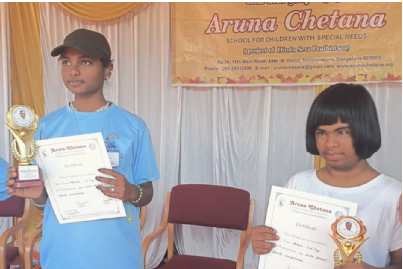
Divya Kreedha Shakthi