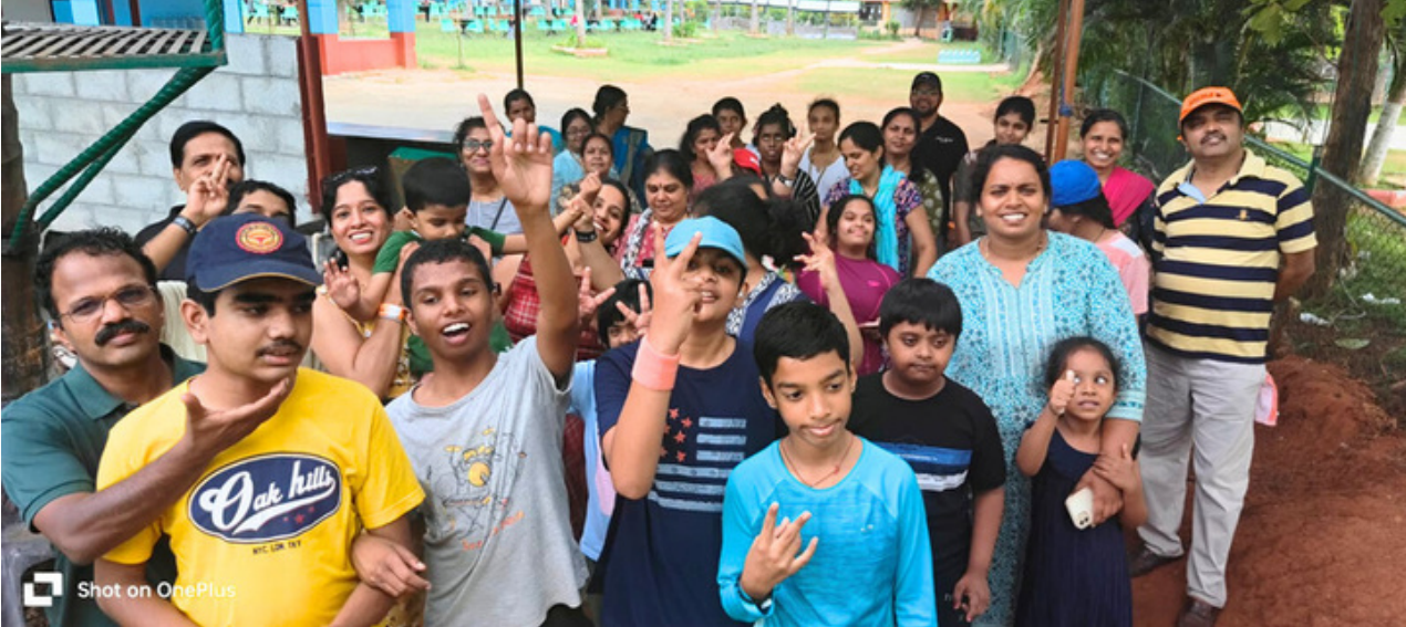
Field trip to Ruppi's resort