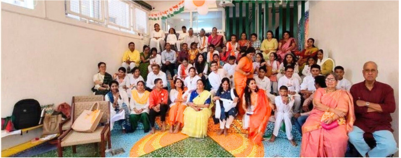
Independence day celebrations